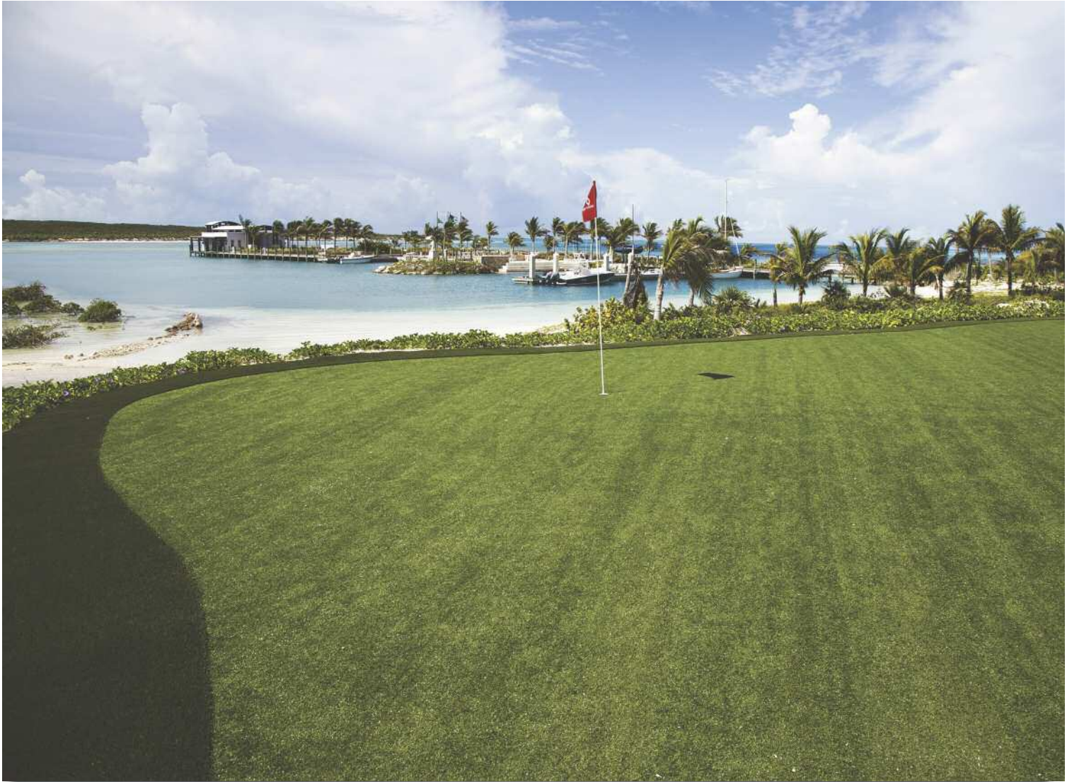
Over Yonder Cay's facilities include a nine-hole golf course, which in keeping with the environmental considerations of the island does not need pesticides or intensive irrigation.