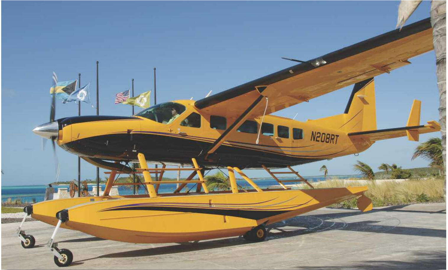
Guests travel to Over Yonder Cay by Cessna Grand Caravan seaplane. Local catches from the water like this red snapper make for delicious, fresh dinners.