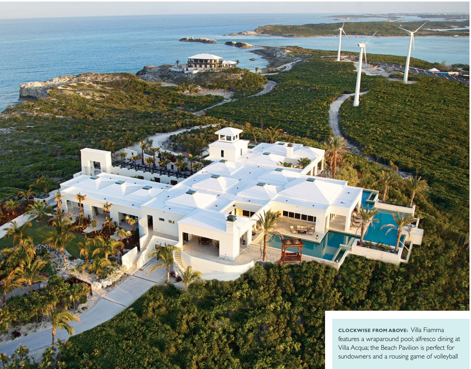
CLOCKWISE FROM ABOVE: Villa Fiamma features a wraparound pool; alfresco dining at Villa Acqua; the Beach Pavilion is perfect for sundowners and a rousing game of volleyball