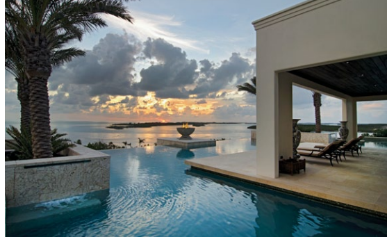
Sunset over the infinity pool at Villa Fiamma is as dramatic as day-time views of turquoise waters