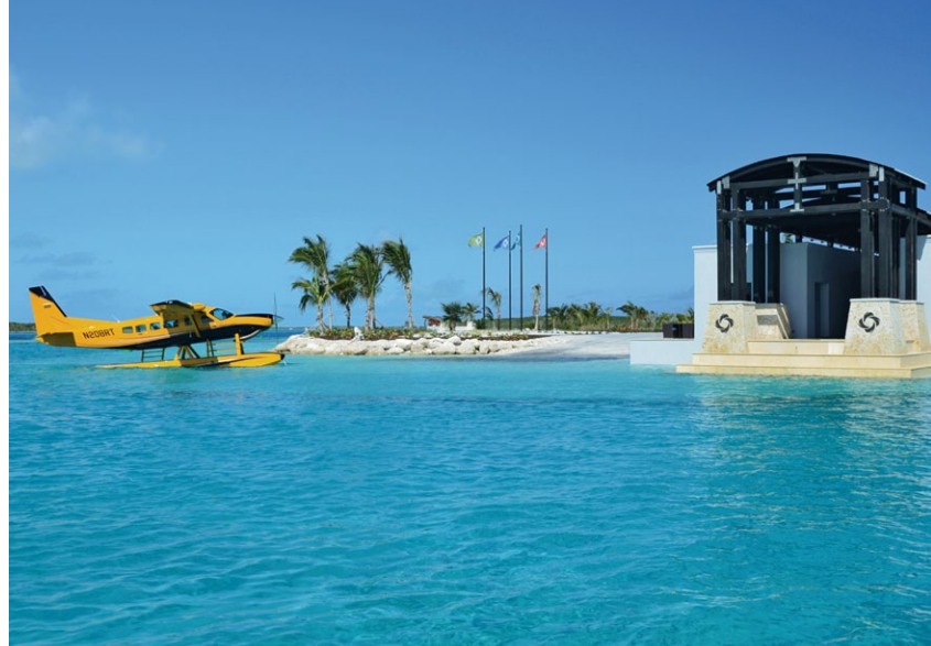
A landing ramp for the Cessna Caravan is next to the boathouse

Over Yonder Cay also boasts the Exumas' only deep-draft marina. It accommodates yachts up to 200 feet in length and 13 feet in depth at high tide. In fact, the Bosarge Family Office's very own Tenacious can dock there and is available for charter along with the island or as a vacation extension. The marina also welcomes yachtsmen cruising the Bahamas in their own boats. If the island is